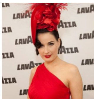
Dita Von Teese