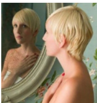
You Are Whole